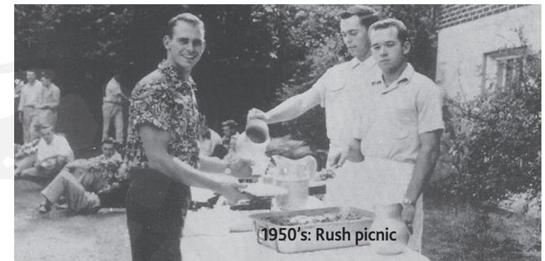
1950's: Rush picnic