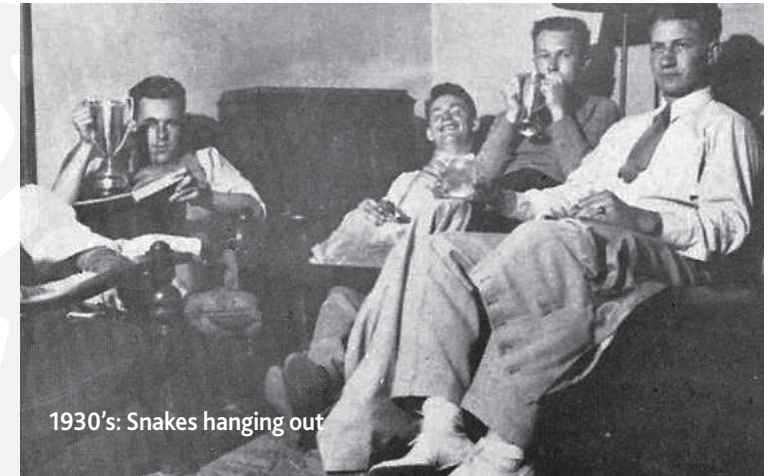
1930's: Snakes hanging out