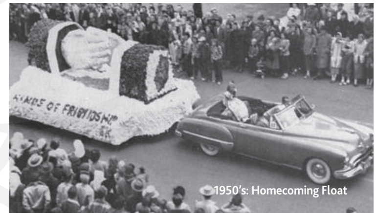
1950's: Homecoming Float