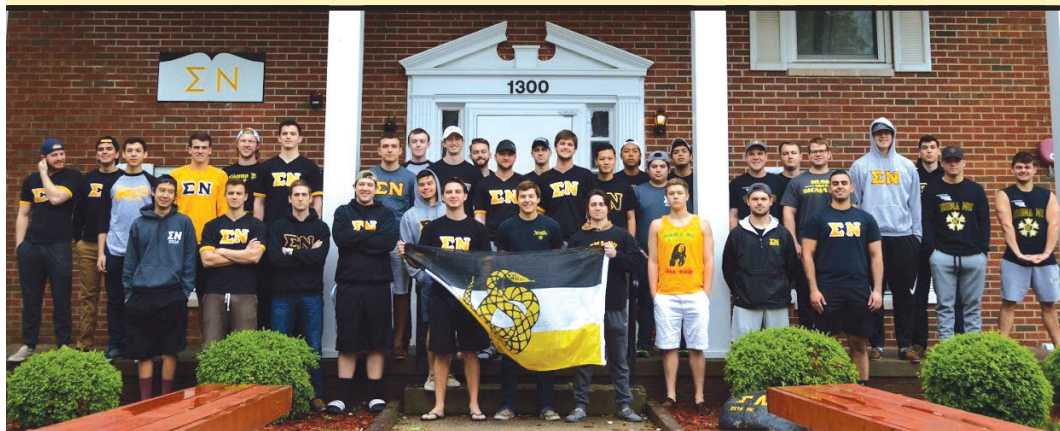
The men of Zeta Phi.