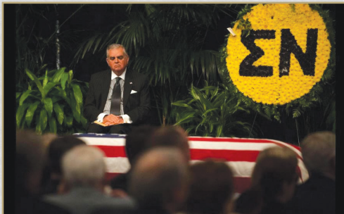
Former U.S. Rep. Ray LaHood remembers his predecessor and mentor Robert “Bob” Michel ’48 (ZΦ90).