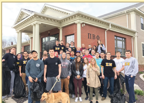
Zeta Phi undergraduates clean up the neighborhood with Pi Beta Phi.

Over the summer, the chapter house underwent a revamping in order to be in the best possible shape to help with recruitment and the overall image. Some of these improvements included external work (repainting the large front bench, various smaller benches, new windows and window shutters) and other internal work. The active room underwent a complete transformation, newly furnished and much more welcoming. Other improvements included improving the bathrooms, a company grade printer, and small everyday repairs.