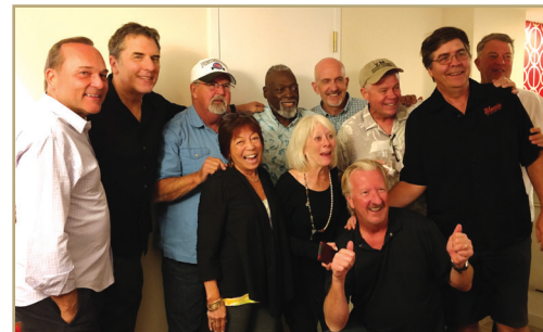
Sigma Nu reunion 2017.

Overall, the reunion was highly successful and long overdue! The call is to do it all again in Chicago in 2019.