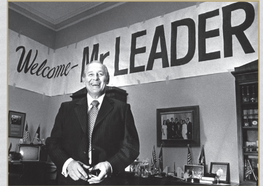
Robert “Bob” Michel ’48 (ZΦ90) in his office after he was elected House minority leader in 1980.

Although his knowledge in politics was great, others would say Bob’s talents went beyond