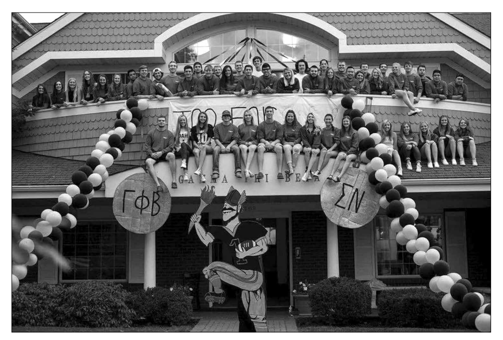
Brothers partnered with Gamma Phi Beta for Homecoming 2017.

After a successful fall semester, the men of Sigma Nu finished another term with academic success, placing among the top fraternities with a 3.02 GPA and a freshmen average GPA of 3.14. We are further improving our scholarship program throughout the year and have seen great progress in all members, as well as our highest freshmen average GPA to date!