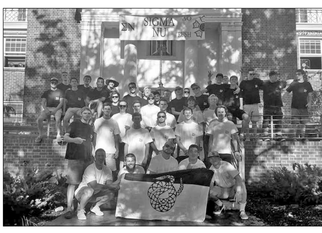
Brothers gather on the steps of the house during Bid Day 2016.

To contribute to this important effort, please visit gofundme.com/SigmaNuRush .