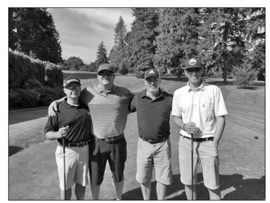
Delta Omicron alumni gather for a round of golf during the weekend of the Vandal vs. University of Washington football game.